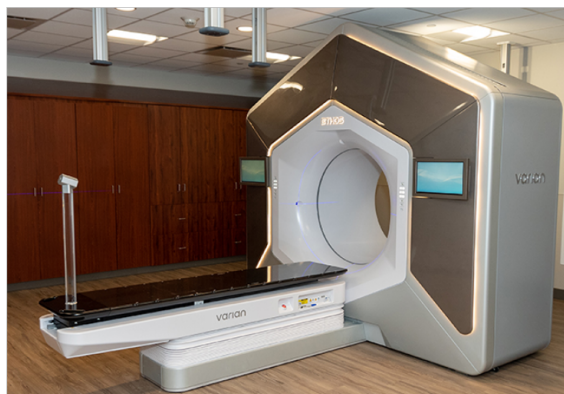
Figure 1: The ETHOS (Varian) medical linear accelerator, that will be installed at ICANS in 2024. This highly sophisticated machine is associated with new AI softwares (including auto-contouring) designed for online adaptive radiotherapy.

Recent advances in automatic segmentation using deep learning have led to the emergence of solutions for the delineation of structures in radiotherapy (organs at risk and tumors). These solutions help doctors by providing automatic contouring which can be used as a starting point for delineation. They also enable real-time adaptation of treatment by integrating automatic delineation from the patient's positioning image during treatment, leading to truly adaptive radiotherapy, which is one of the most promising evolutions of radiotherapy. At the end of 2023, ICANS acquired a first commercial solution (ART-Plan Annotate from TheraPanacea) [1, 2] allowing the automatic delineation of organs and tumors, aiming to improve the reproducibility of contours and to help doctors. In 2024, the ICANS technical platform will also see the arrival of the latest generation of radiotherapy system (Fig. 1): Ethos v2 + HyperSight (Varian) [3, 4]. This system includes another commercial solution for auto-contouring, that allows direct online adaptive radiotherapy. In this context, it is crucial for doctors and physicists to know the expected performance of different tools to ensure the validity of delineation and the safety of the treated patients. Furthermore, from