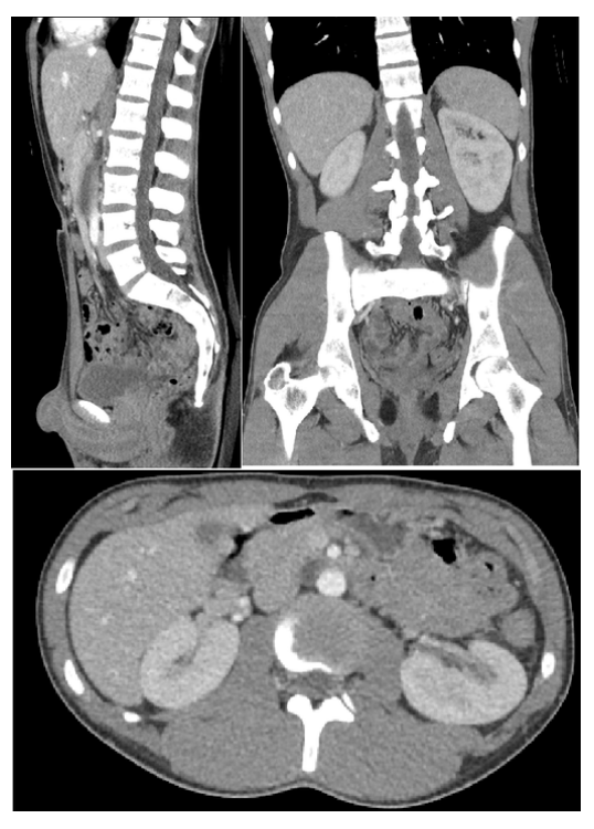
Abdominal CT image